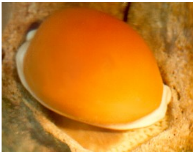
Cypraea Aurantium sitting on its eggs.