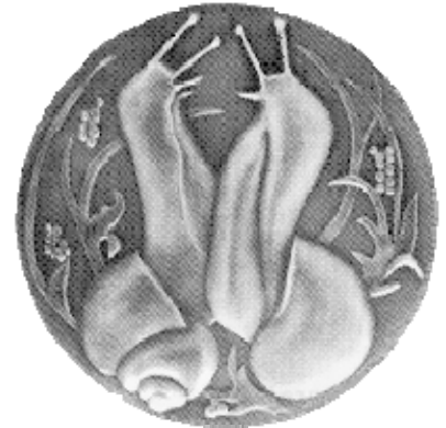
(Logo of the NMV from the web site)

The society has existed since 1934 and now counts about 540 members of which about 60 % live in the Netherlands."