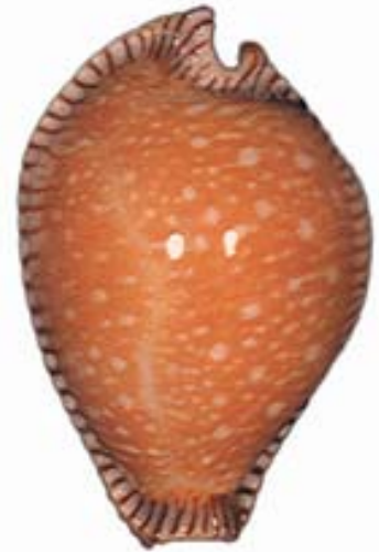
Erosaria guttata surinensis , Raybaudi 1978