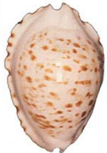
Zoila marginata ketyana , Raybaudi 1978