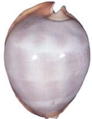
Zoila thersites eburnea , Raybaudi 1985