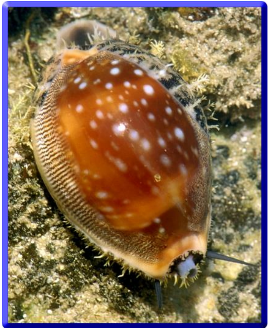
Cypraea vitellus live at Kurnell, Sydney