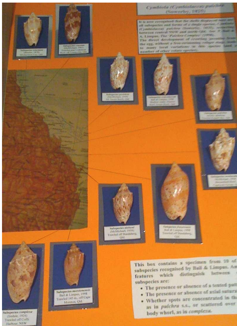
COA - winning exhibit (box one of five) Variation of one species – Five different sets of Volutidae species Trevor Appleton

To appreciate, understand and preserve shells and their environment and to share this with others.