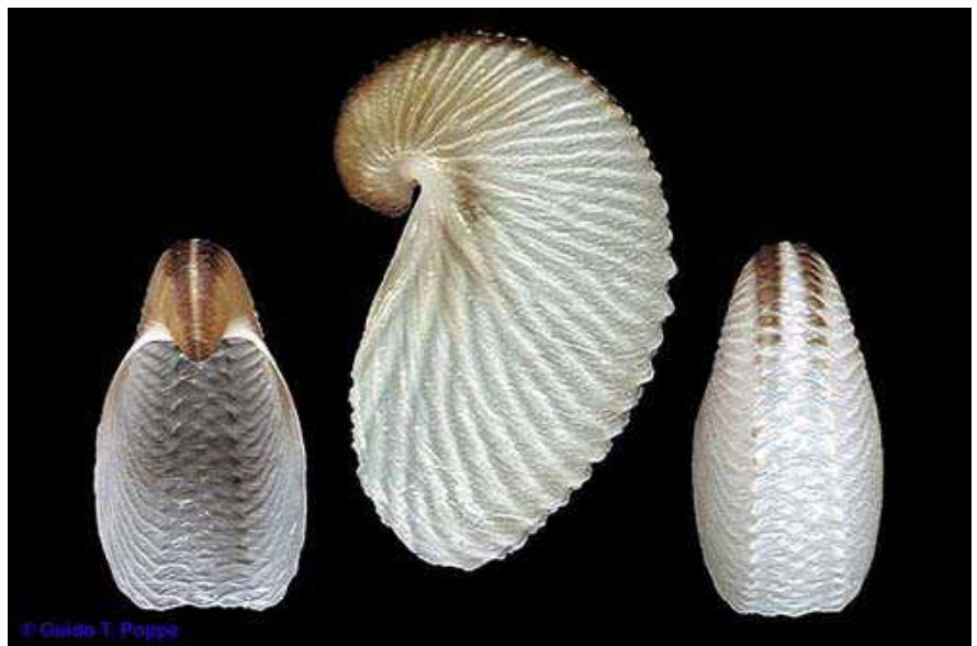
Argonauta nouryi Lorois, 1852