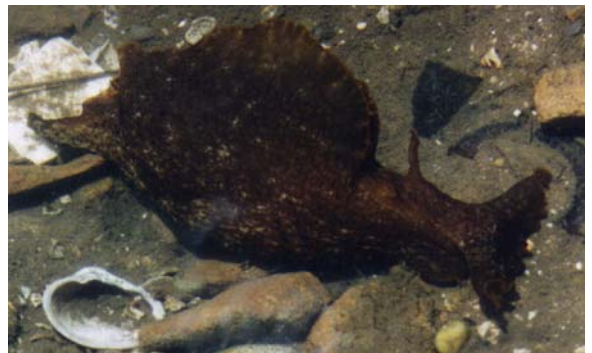
Aplysia Extraordinaria Northern beach

An unusual man made feature on the island is the Grotto. This semi cave, located under the northern end of the "conference" centre has a supporting column which features a decoration of tropical corals and 5 large specimens of Trochus niloticus ! There is no explanation of why the column was built, when it was built, who built it or how the tropical corals and shells came to be used. Given the quirky history of the Island anything is possible.