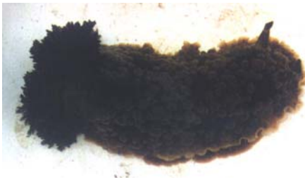
Dendrodoris fumatus Northern beach

The clear streams flowing into the upper reaches of Iron Cove would have been unpolluted back then and fringed with large stands of mangroves that would have supported a diverse fauna. Even today the remaining patches of mangroves still support a number of species.