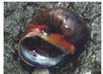
Polinices sordidus From Children's swimming area