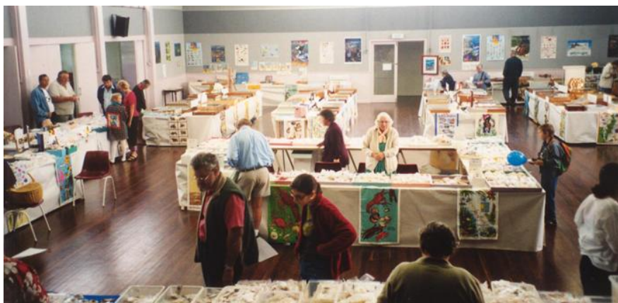
Keppel Bay Shell Show 2001