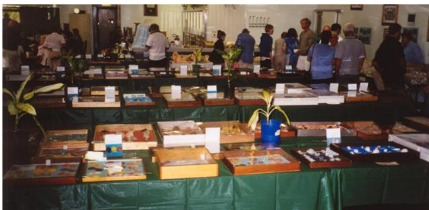
Townsville Shell Show 2001