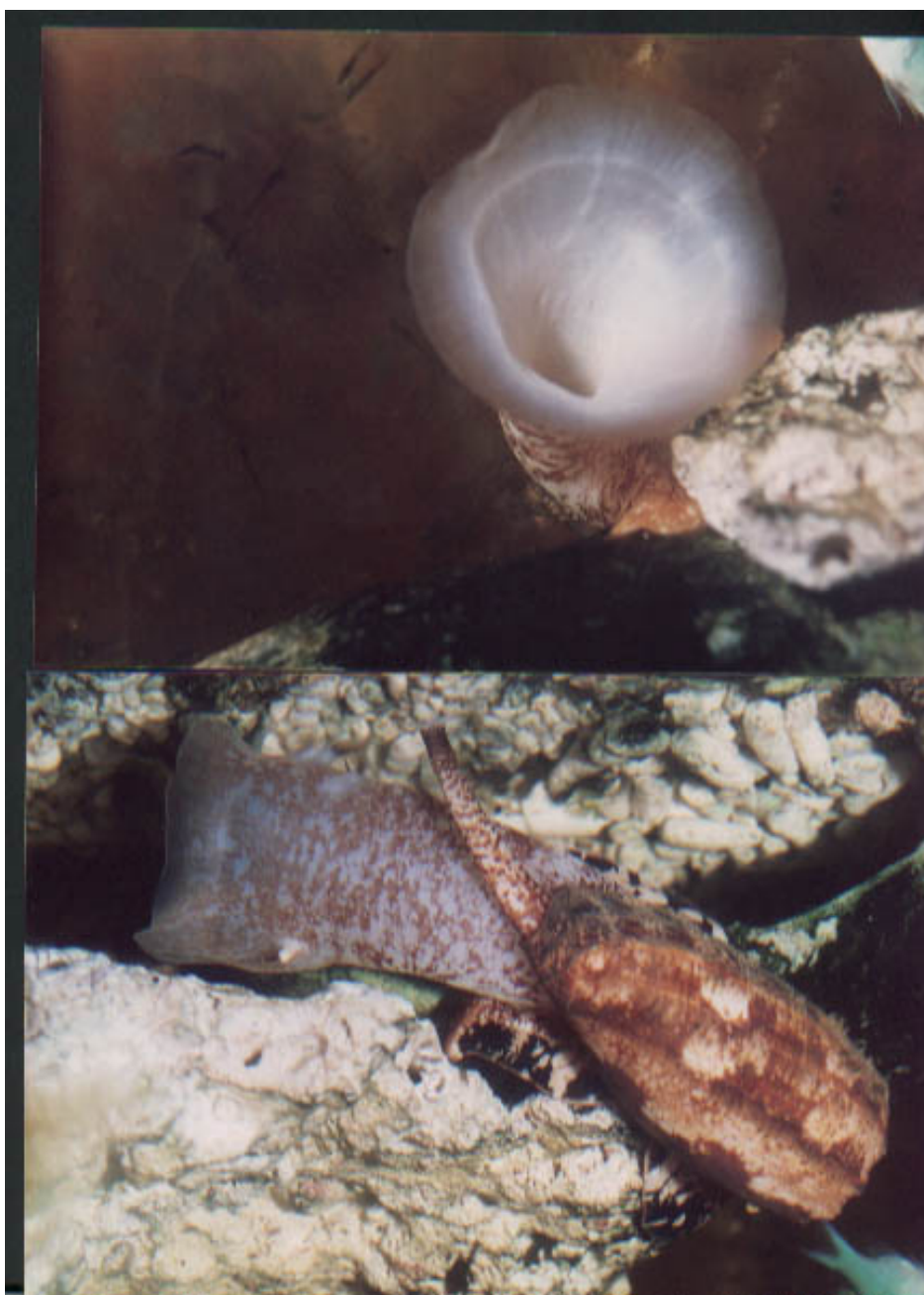
'Pet Cone' Original Photos