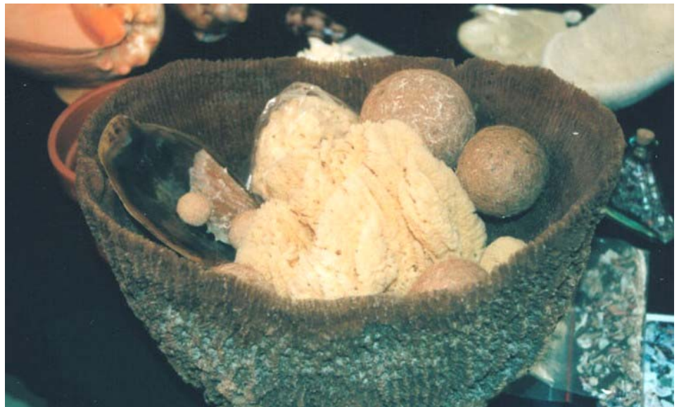
Part of Maureen's unusual, diverse and interesting presentation to a group of non-shell collectors to wet their appetites.